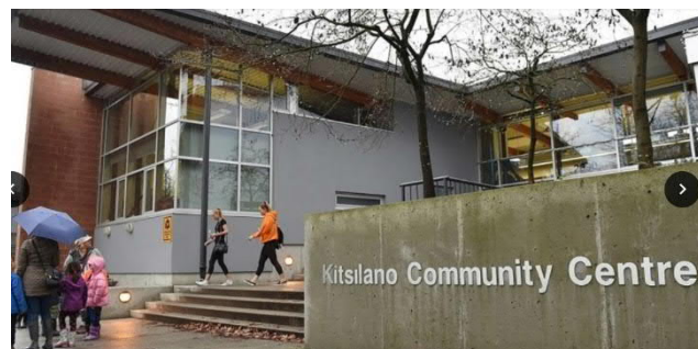
Results: Low Carbon Electrification